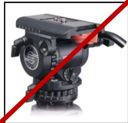
DV 8 SB