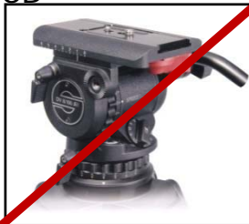
DV 8 /100 SB