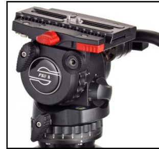
FSB 8 / FSB 8 T