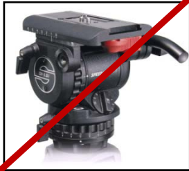
DV 6 SB