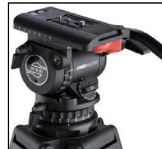
DV 10 SB